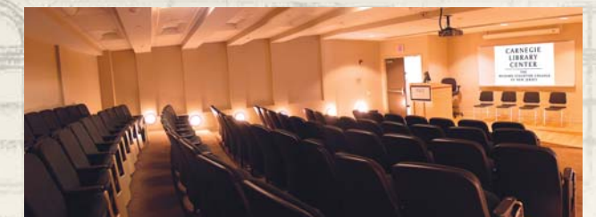
CARNEGIE LIBRARY CENTER THE RICHARD STOCKTON COLLEGE OF NEW JERSEY

Each room is wired with the latest technology, including wall-mounted displays, high-speed Internet access, document camera and DVD/VCR players. Wireless high-speed internet access (WiFi) is throughout the facility, and a mobile cart with 6 laptops with wireless capability is available. A full range of catering services is available from light refreshments to formal white linen service.